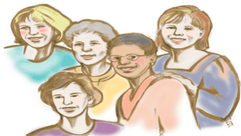
Women of the Church

THE CHURCH OFFICE will be closed Monday, September 6 th in observance of Labor Day.