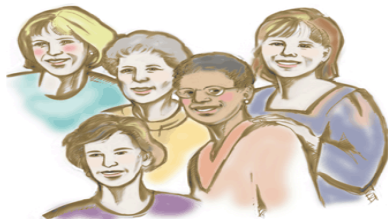
Women of the Church