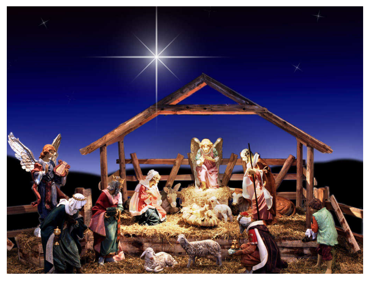
CHRISTMAS EVE SERVICE

It will be an extra special treat! Don't miss it. We will be live and also livestreaming it.