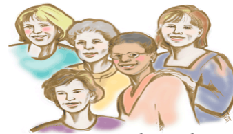
Women of the Church